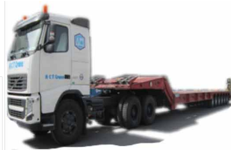
TRAILER (LOWBED AND FLATBED)